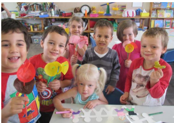
2016 Kindergarten group enjoying the activities last Friday.